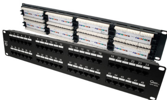
Network Patch Panels