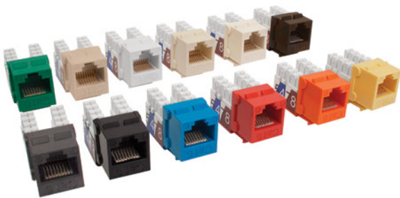
Keystone Jacks & Adapters

Our Rollout Project Management team provides exceptional customer service and technical expertise to assist your staff in making sure that all required installation products are at the worksite on-time and when needed.