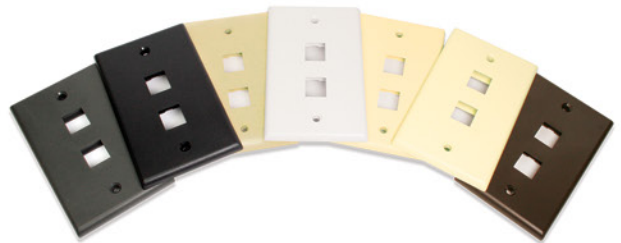
Keystone Wall Plates