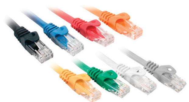
Network Patch Cords