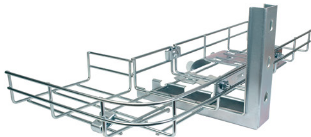
Cable Trays & Wire Managers