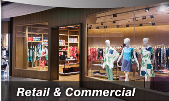
Retail & Commercial