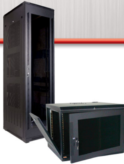
Floor & Wall Enclosures