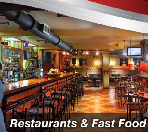
Restaurants & Fast Food