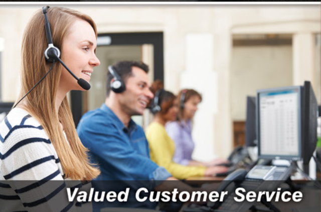
Valued Customer Service